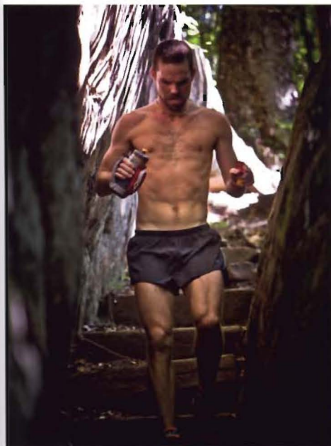
Putting the hammer down, down, down