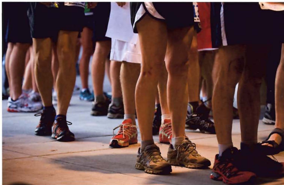
A rock's-eye view moments before the start

The Rock/Creek StumpJump course would not exist in its current location without the support of the Cumberland Trail Conference, a non-profit organization responsible for trail building, maintenance, and fund raising for what will eventually be a 300-plus-mile trail stretching across the state of Tennessee. ■