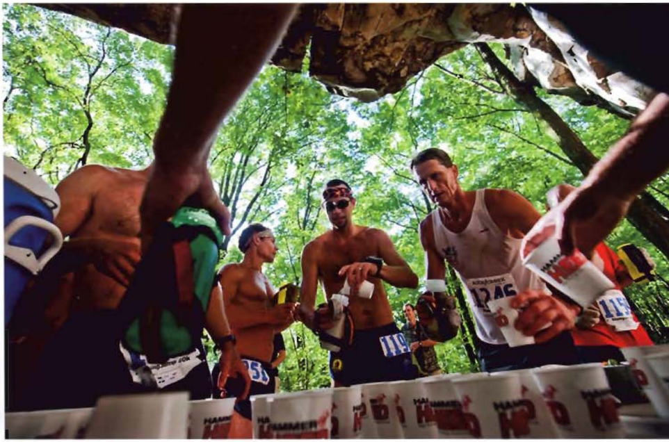
Aid station madness