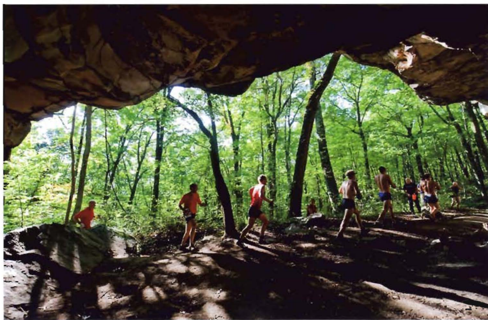
Under the ledge